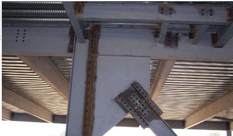
Fig. 2B: During an earthquake, conventional braces typically generate larger maximum forces than buckling-restrained braces, so their connections are much larger.